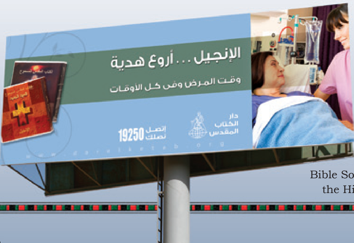
Bible Society Billboards on the Highways of Egypt